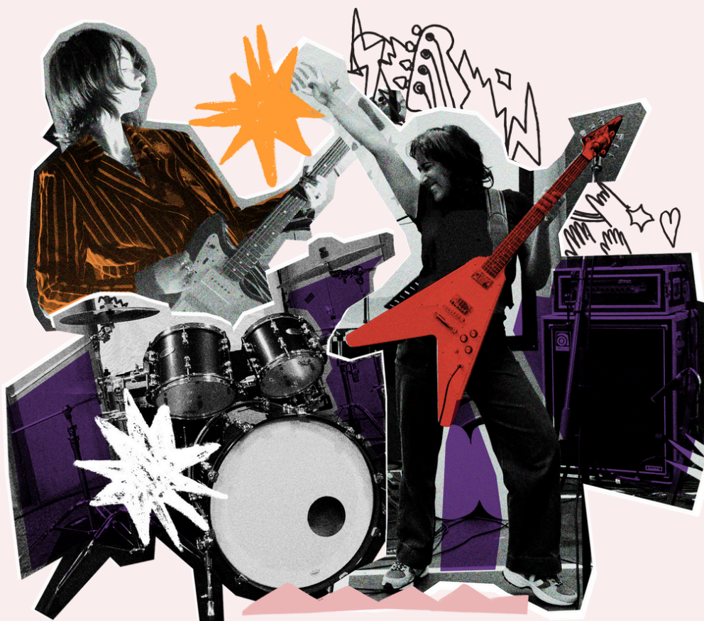
To the Front holiday programme Youth Participants